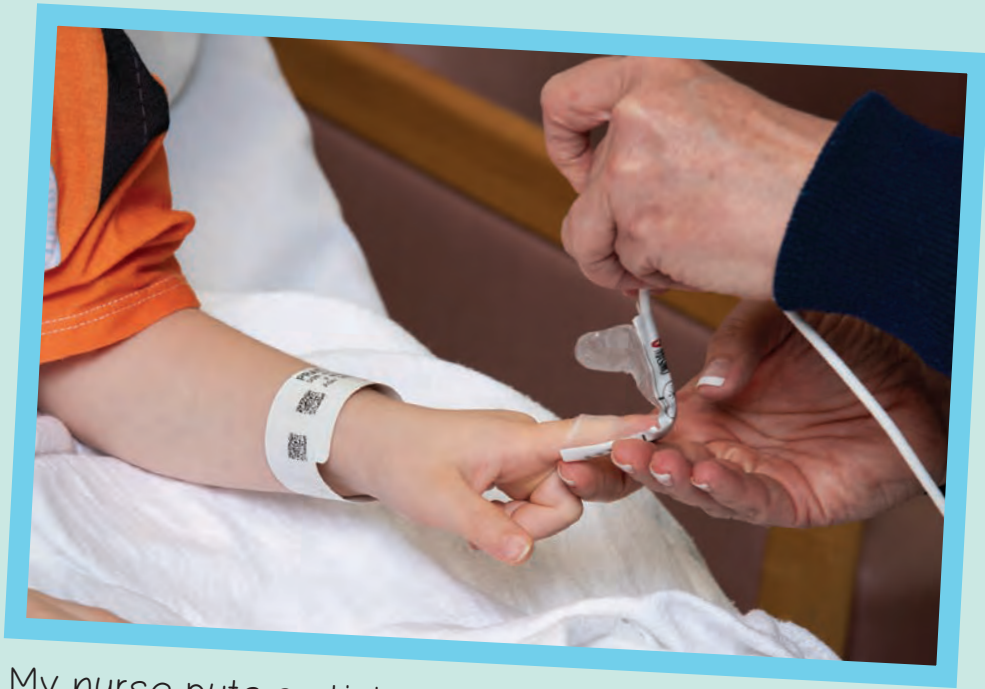
My nurse puts a sticker on my finger that lights up!